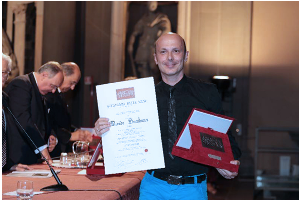
Premio "Tersicore" per la danza