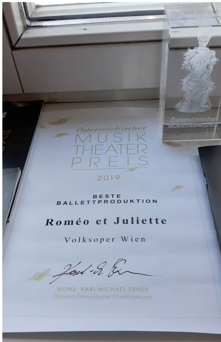
Best Austrian Ballet Production 2019 for "Roméo et Juliette" – Wiener Staatsballett